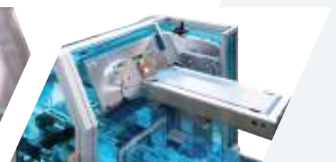
Product tying bay