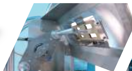
Ties loading mechanism