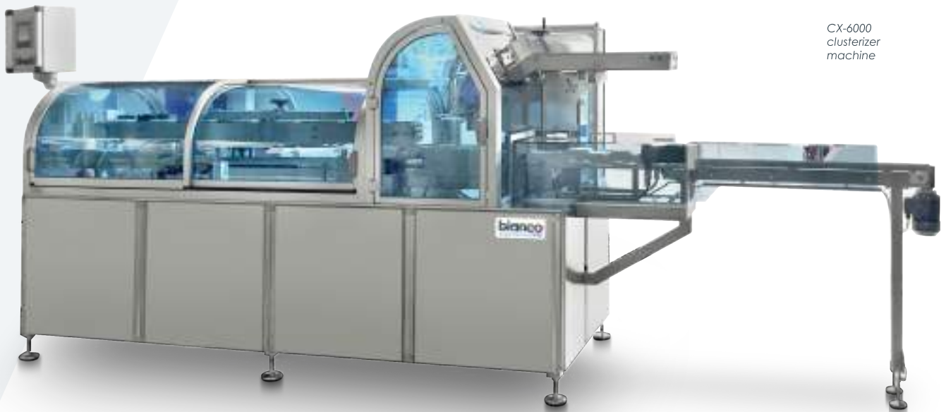
CX-6000 clusterizer machine

The CX-6000 clusteriser machine wraps products such as trays, cups, yogurt, cans, in multipacks or individual-product, by starting with tight cardboard straps, closed at the bottom with hot glue applied by