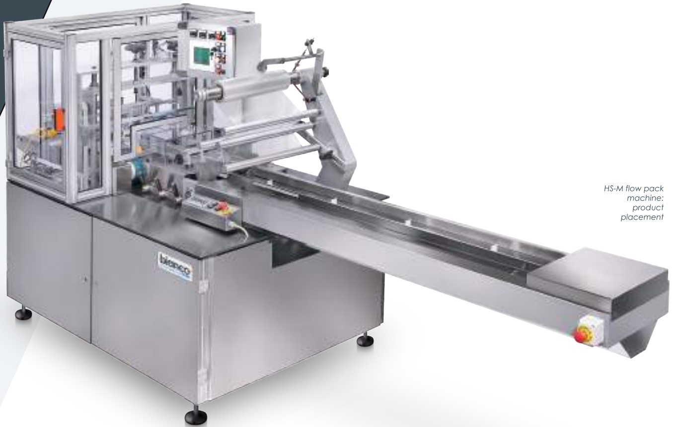
HS-M flow pack machine: product placement

The HS-M Box Motion electronic flow pack machine can pack a very large range of products allowing protection from external agents. An optional device allows enclosing the product in a modified atmosphere to ensure maximum conservation.