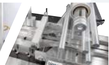
Lower welding product bay