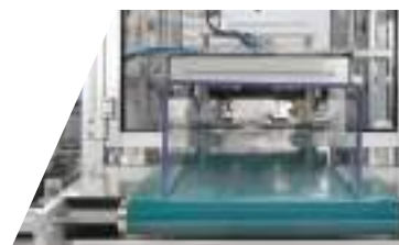
Bar-assisted welding head