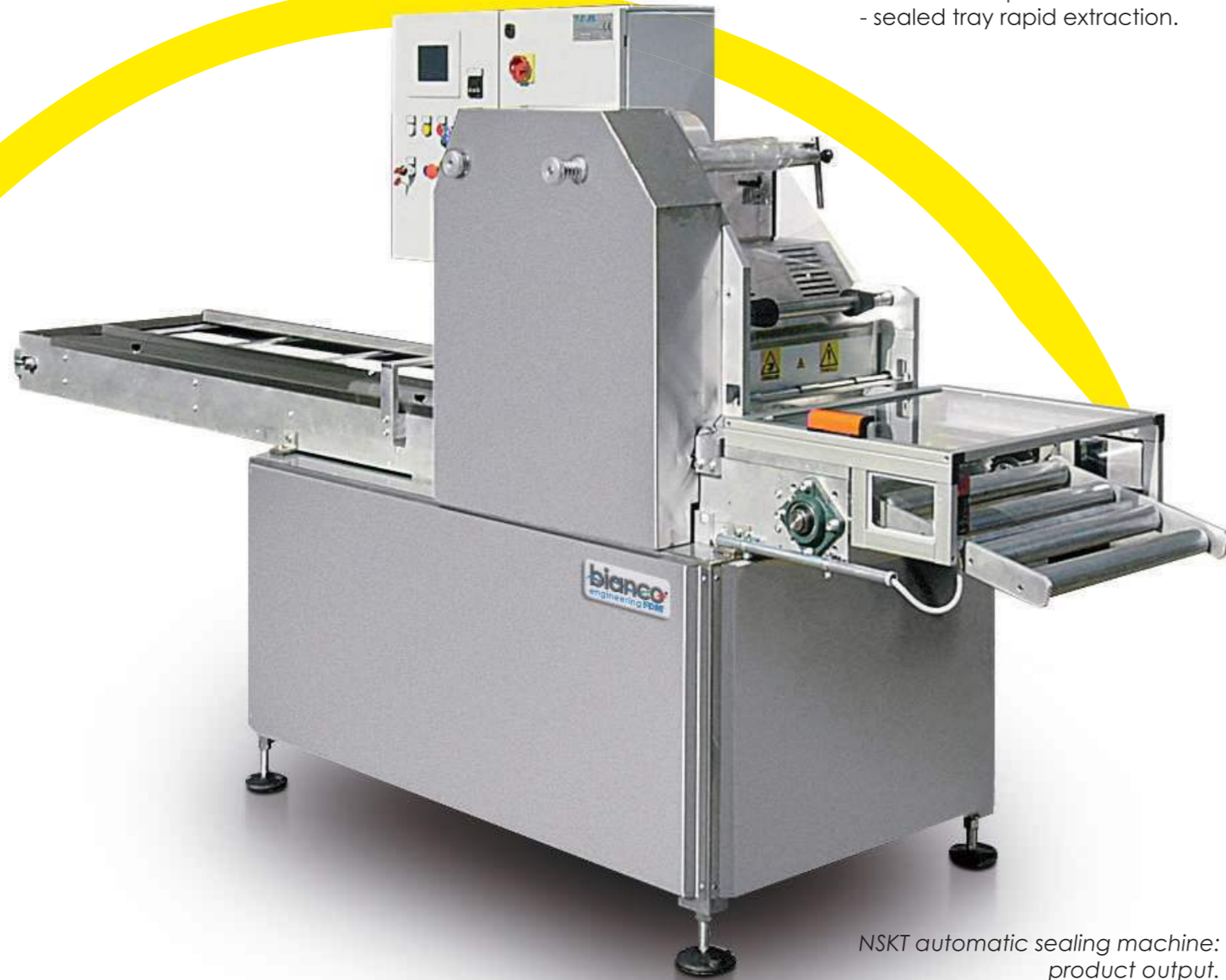
NSKT automatic sealing machine: product output.