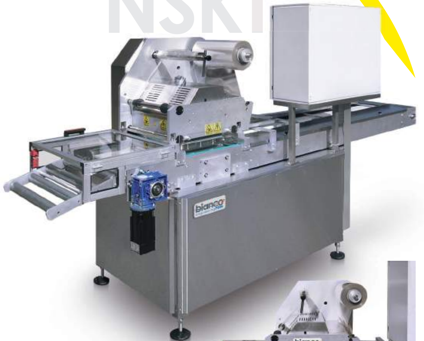
NSKT automatic sealing machine: reel detail.